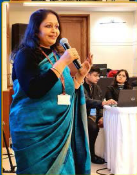
Capacity Building Workshop on 'Gender Mainstreaming at Land Ports' organized by LPAI in collaboration with @ICRIER.