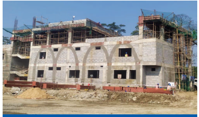
Police Station Building