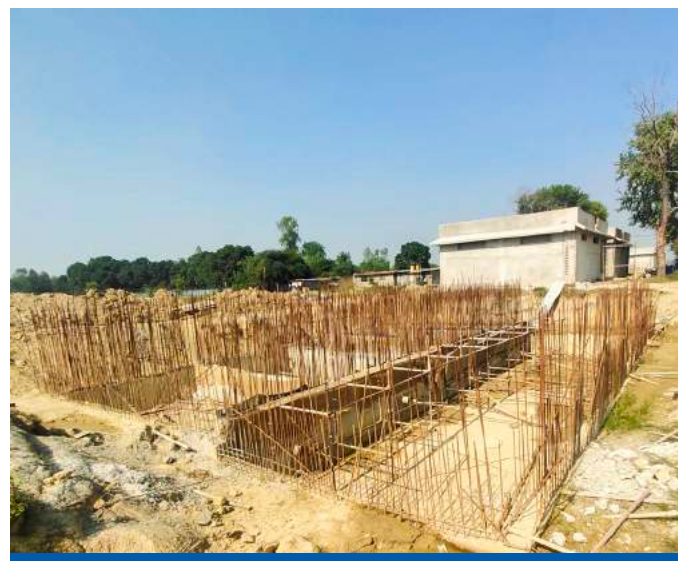
Pump Room Foundation