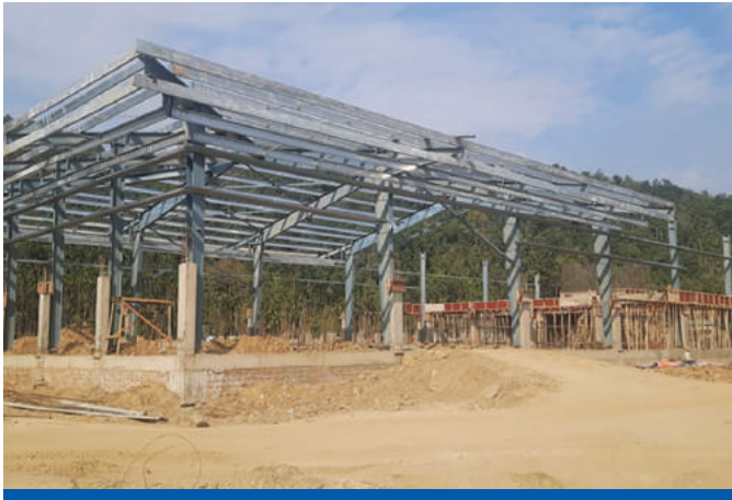
Warehouse Structure Steel Work