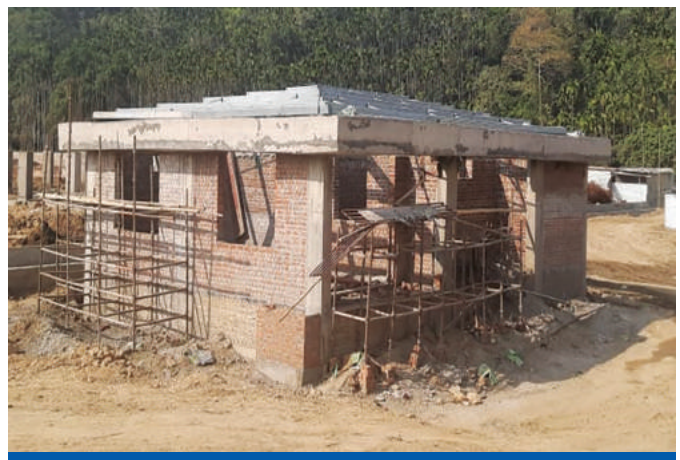
Indian Side- Toilet Block