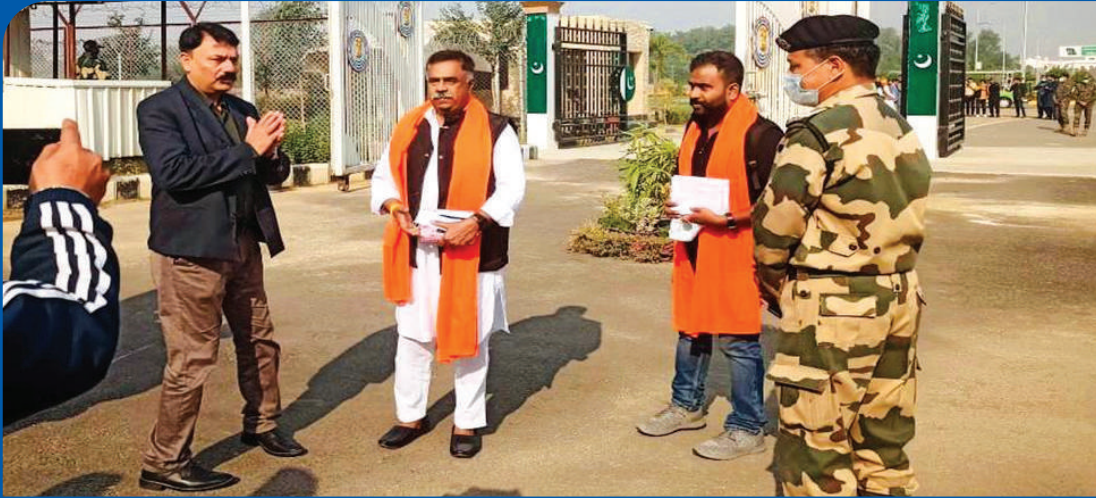
LPAI and BSF officials honoured the first seven pilgrims with Siropa (robe of honour) and sweets at PTB Dera Baba Nanak