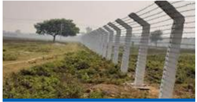
Chain Link Fencing at Site