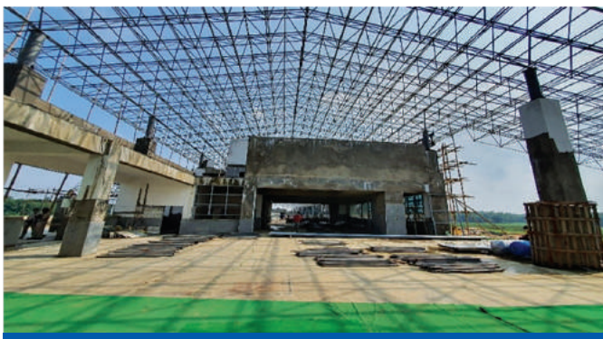
Passenger Terminal Building under Construction