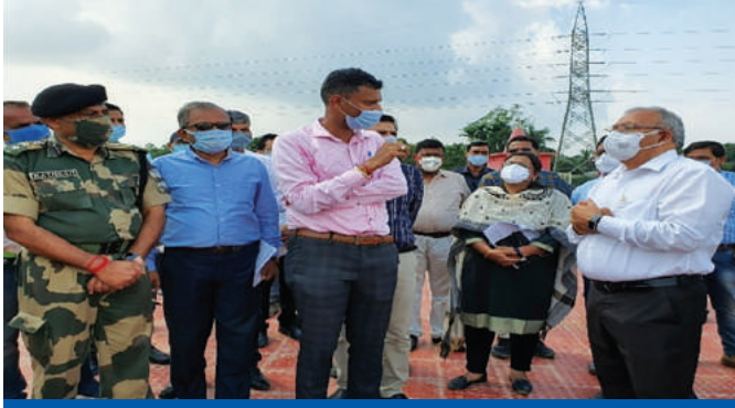
Site Visit of Chief Secretary Govt. of Tripura