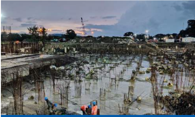
Passenger Terminal Building