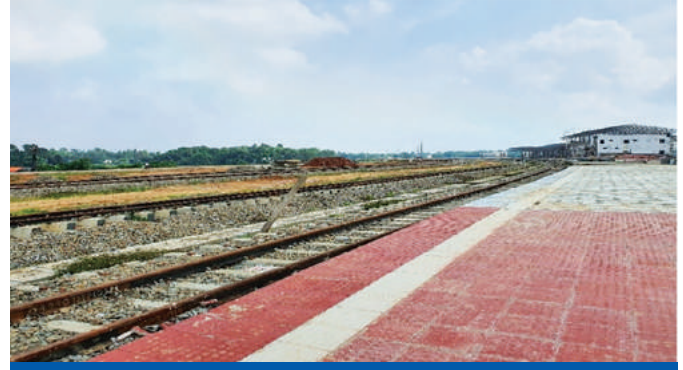
Railway Lines 4MG Already Completed on Site