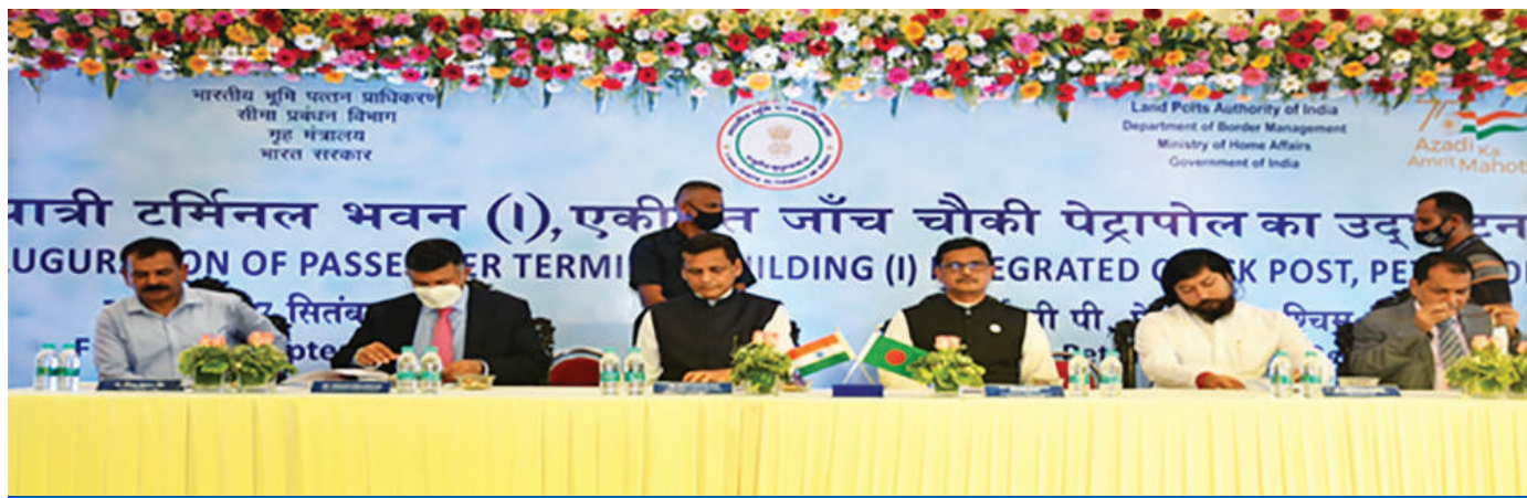
Chief Guests during inauguration of PTB (I) at ICP Petrapole on 17th September 2021

During the inaugural ceremony, the Chief Guests also laid the foundation stone of a common second cargo gate along the India-Bangladesh border. By setting an example of strong Border Agency Coordination between LPAI and BLPA, this move is expected to speed up the release/clearance of goods at the border crossing through a better institutional arrangement and further enhance bilateral trade and connectivity between the two countries.