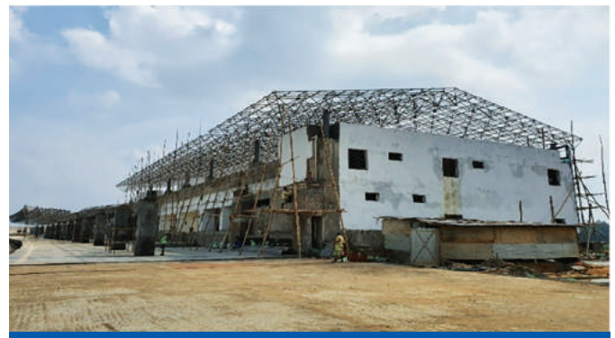
Passenger Terminal Building and platform