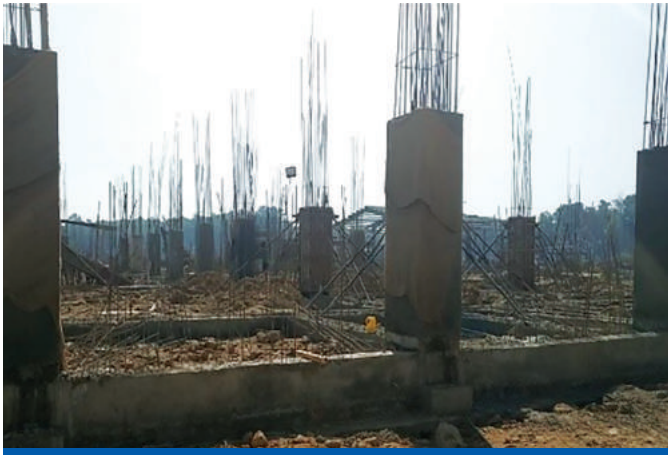
Cargo Terminal Building – RCC Column work