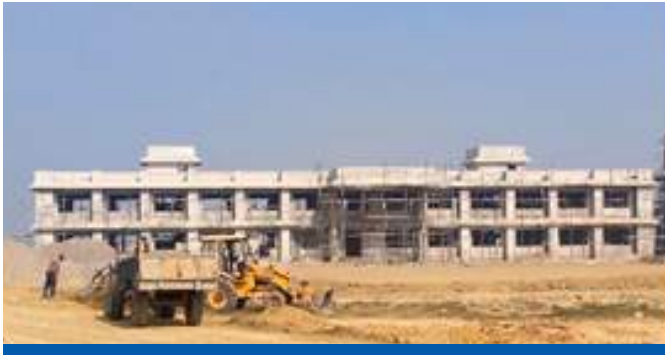
Cargo Terminal Building