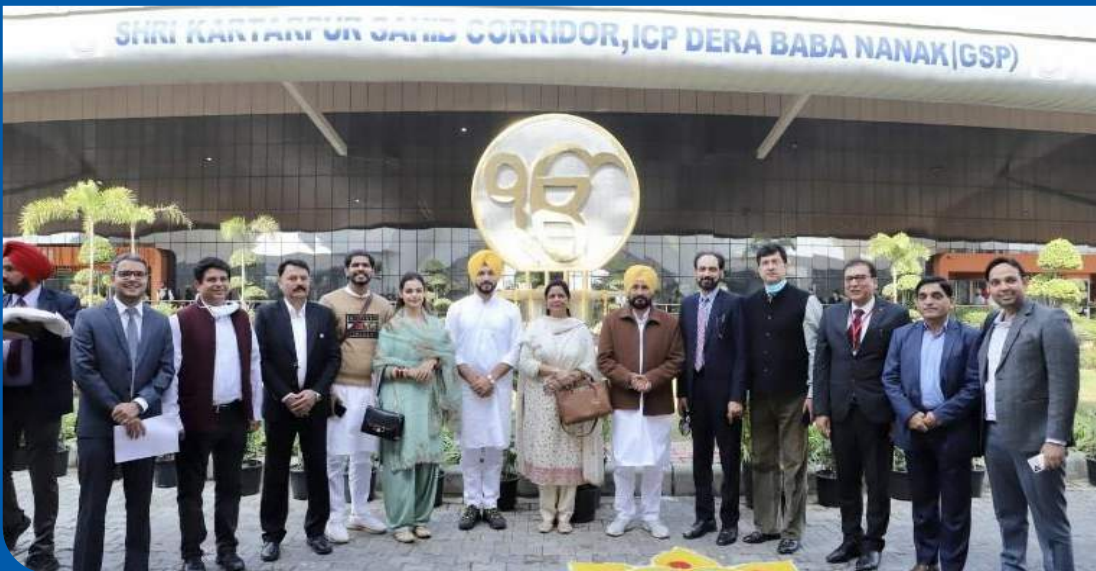
Punjab Cabinet pays obeisance at Kartarpur Sahib