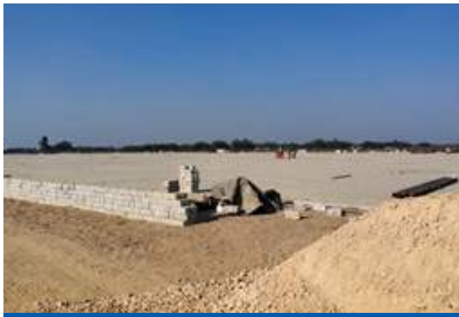
Truck Parking–Paver Block Work