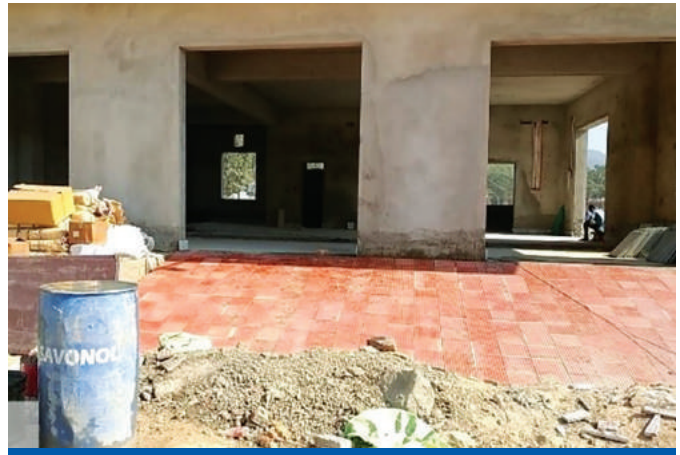
Electric Sub-station- Flooring Work