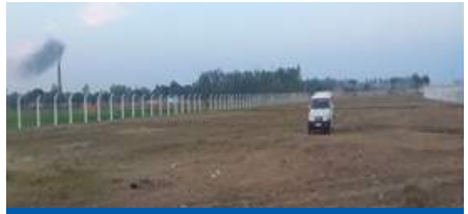
Chain Link Fencing at Site